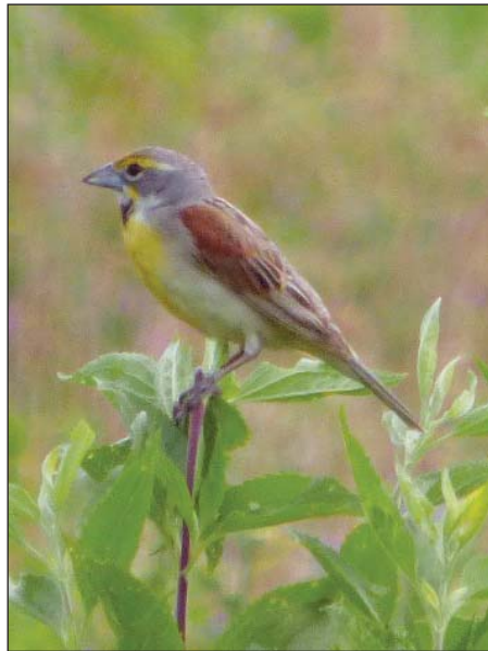
Male Dickcissel at Dorbrook Rec. Area

Last summer the MCAS board was alerted to a change in mowing practices at this location, which raised concerns about the nesting Grasshopper Sparrows.