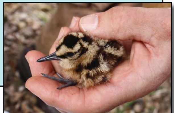
Bird banding demonstration