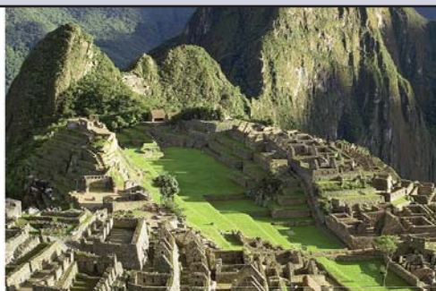
Travels in Peru