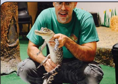
Family Night Fun